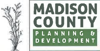
Big Bluestem Level