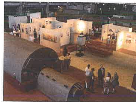
Turbine Deck Art Show (2014)

By expanding our geographical reach to the Midwest, we also are presented with an opportunity to double down on our environmental benefits. In addition to reducing hazardous emissions such as NOx, SO2, and Mercury to minimal levels, our units also emit 60% less CO2 than most coal facilities. With advances in our understanding of the ability of soils to hold carbon sequestered by plants via photosynthesis, Footprint Power seeks to reduce our environmental impact even further by partnering with local farmers to incentivize and support sustainable soil management practices, such as low/no-till and cover cropping, which maximize these natural processes. In addition to offsetting carbon produced, such practices have the potential to provide the co-benefits of better soil health, increased crop yields, reduced fertilizer inputs and improved water quality. Understanding that these practices come with costs and challenges, Footprint Power wants to work with local farmers and their established support systems to find ways to incentivize and foster adoption of these practices. Our hope is that these practices will be rewarding both for our farming neighbors and their customers, and for our environment.