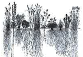
Grand Prairie Level