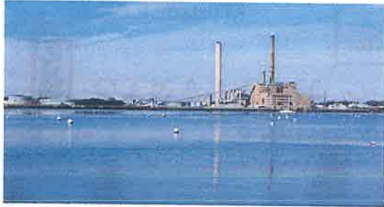
Old Salem Harbor Station (2014)

Footprint Power LLC is a power plant developer, based in New Jersey and founded on the notion that power plants are community resources that must serve their neighbors with not just the electric power they produce but also in their alignment with the issues that matter to local stakeholders. Our first project in Salem, Massachusetts involved the temporary operation of a coal facility, the shut-down of that facility and its replacement with a new gas-fired plant. The project involved not just the transition in the physical plant and stewardship of the land on which it is located, but also addressing the needs of our staff as they moved on to new jobs (either at the new plant or in new settings) and the needs of our neighbors as we worked to maintain the tax base, to improve local property values and to provide new opportunities for waterfront access. For us, the commercial opportunity flows from the thoroughly old fashioned notion that good service will yield good financial results – and, thus far, we have not been disappointed in this belief.