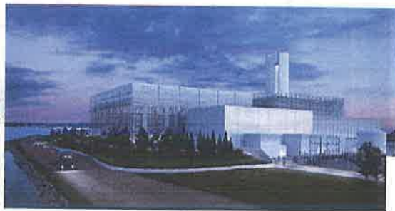
New Salem Harbor Station (2017)

Reducing Carbon Emissions One Step at a Time™